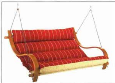
ABOVE: Curved white-oak arms shape The Hammock Source's Hatteras double swing striped in royal red. 800/334-1078; www.thehammocksource.com