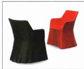
ABOVE: Taking form from classic draping ceremony armchairs, Domitalia's "Phantom" chairs sit well in all settings. www.domitalia.it