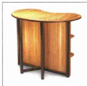
ABOVE: Selamat Designs mixes timbers of plantation-grown teak with bronzed trim in its "Tall Tapas Table." 800/492-1776; www.selamatdesigns.com