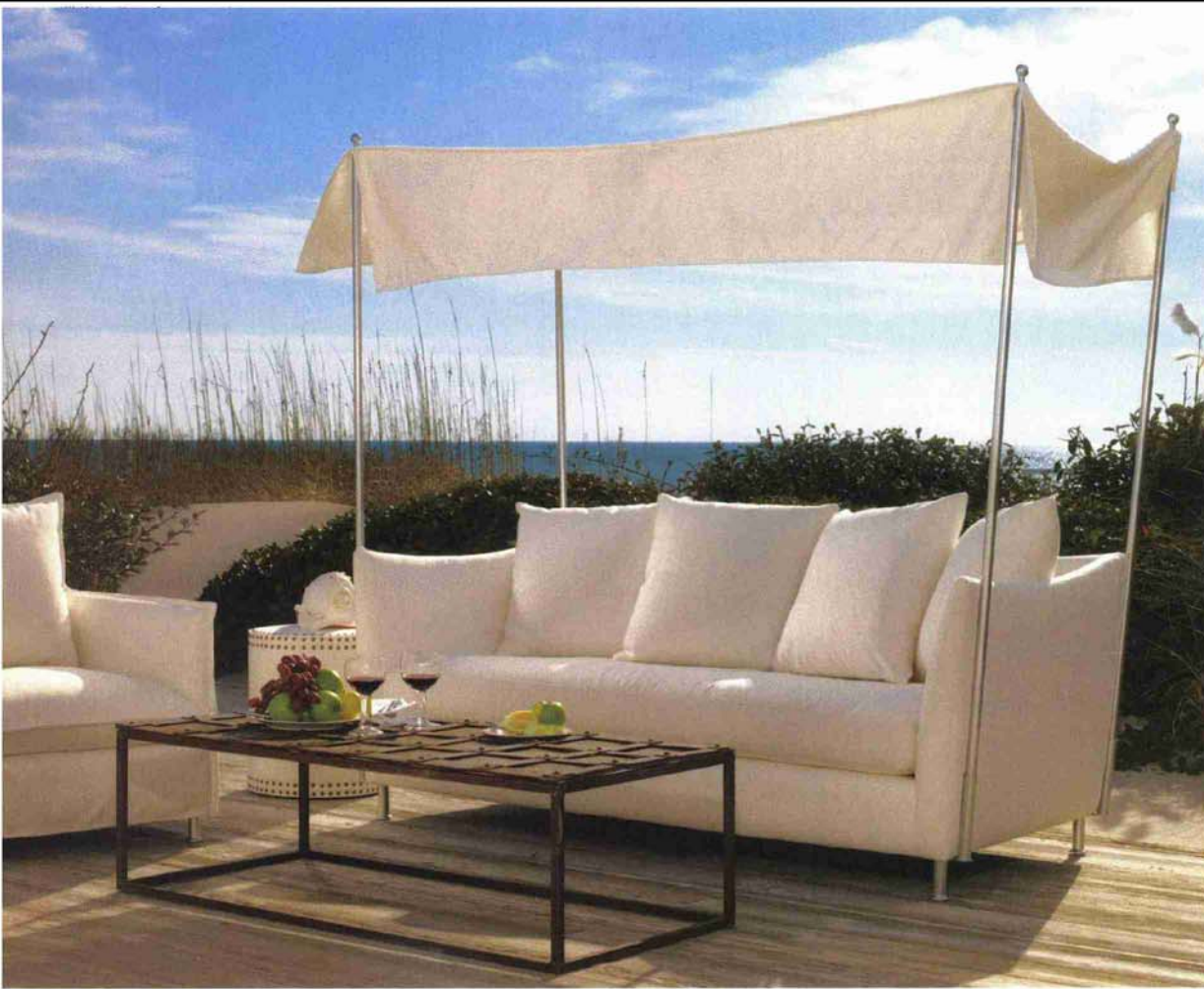
The Oleander Outdoor sofa with canopy and slipcovered armchair from Lee Industries goes beyond furniture and becomes art. 800/892-7150; www.leeindustries.com