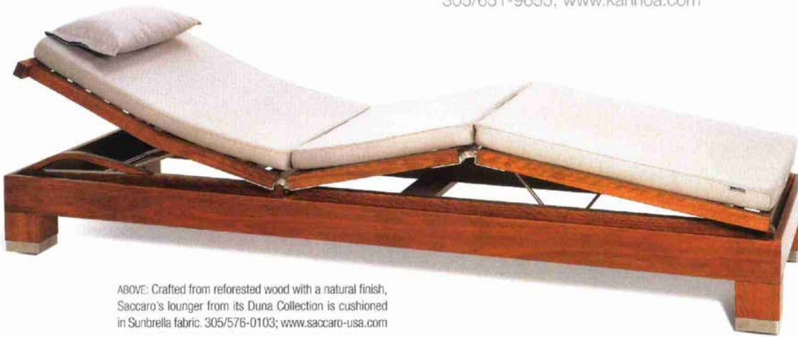
ABOVE: Crafted from reforested wood with a natural finish, Saccaro's lounge from its Duna Collection is cushioned in Sunbrella fabric. 305/576-0103; www.saccaro-usa.com