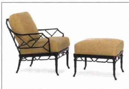
ABOVE: Inspired by Chippendale furniture themes, Brown Jordan's lounge chair and ottoman from its Calcutta II collection features an exotic bamboo pattern and slender tapered legs. 800/743-4252; www.brownjordan.com