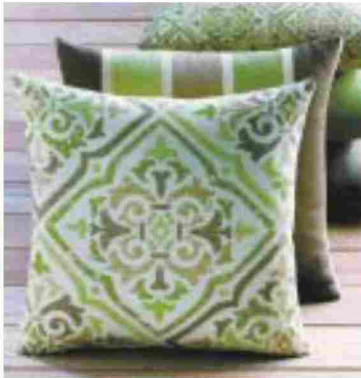
Shades of apple, cream and toast team for a fresh palette.

Whitecraft: 954-921-0775 or whitecraftinc.net