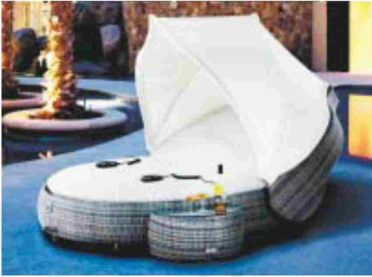
A cocooning clamshell shape provides deep seating with this lounge from Domus Ventures. The chair, about $10,000, also gives a massage.

Domus Ventures: 800-888-5293 or domusventures.com