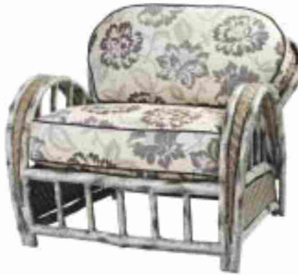
It looks like bent bark but it's actually weather-resistant resin over an aluminum frame. About $2,000.

Domus Ventures: 800-888-5293 or domusventures.com