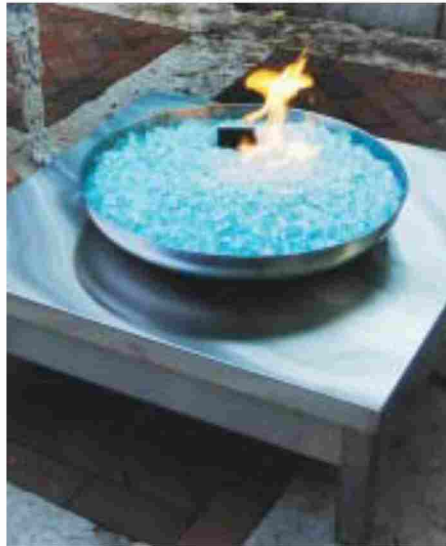
Fire dances across crushed glass in this edgy firepit made of stainless steel. The sleek design creates a striking focal point for after-dark entertaining. The 36-inch-square table, which stands 16 inches tall, sells for $1,699.

Restoration Hardware: 800-910-9836 or restorationhardware.com